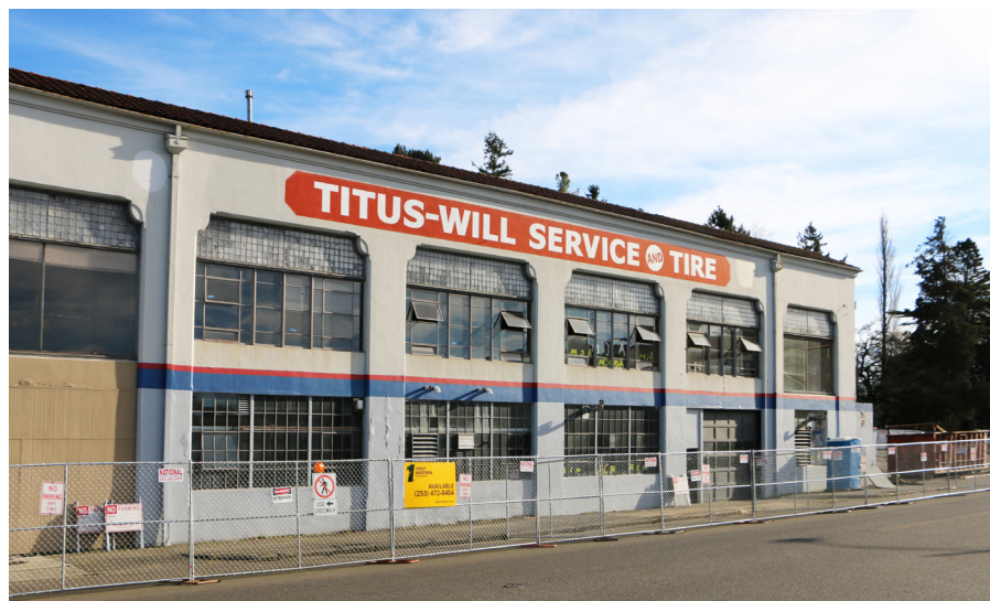
Titus-Will adaptive reuse project