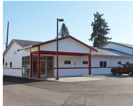
Suburban Propane Offices

Additionally, several of our Tribal clients are expanding their business enterprises. Korsmo is working with the Port Gamble S'Klallam Tribe to construct The Point Hotel, a 94-room hotel featuring Coastal Modern design elements; another Korsmo team recently broke ground on the new River Rock Smoke Shop for the Stillaguamish Tribe in Arlington.