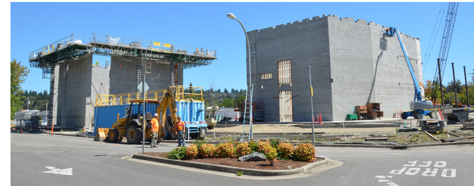
College Instruction Center, Olympic College