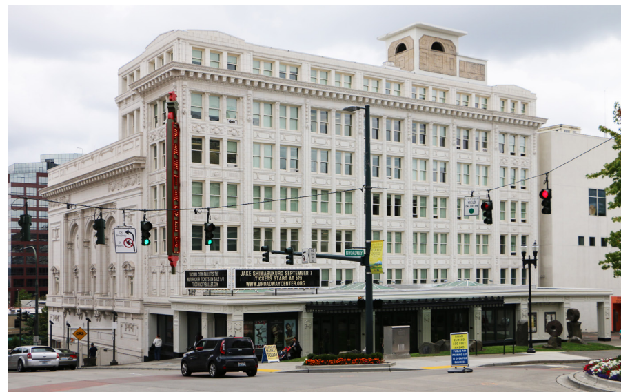
Pantages Theater, Tacoma, WA

Korsmo's ongoing work with Broadway Center for the Performing Arts, a Tacoma-based non-profit organization, continues at the Pantages Theater. Our team recently completed a series of exterior envelope repairs on the nearly 100-year-old building, including the replacement of windows, cleaning the building's white terra cotta surface and installing new signage and lighting. Upcoming work will consist of considerable seismic upgrades in time for its centennial in 2018.