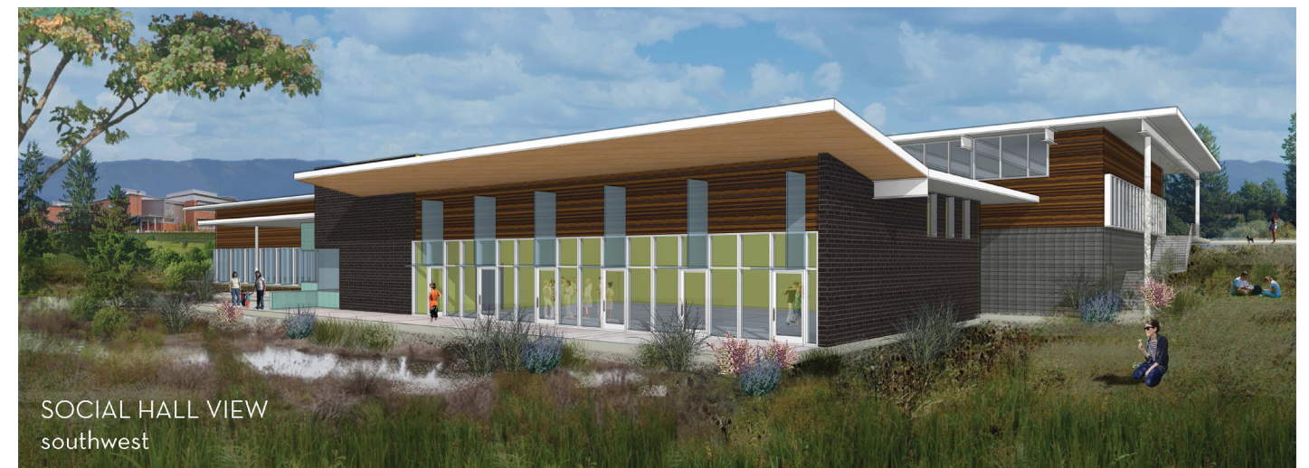
Preliminary design: Eastside Community Center

Encouraging growth in construction projects for local non-profit organizations